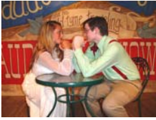
Will love find Justin Time and Lacy Camisole ?