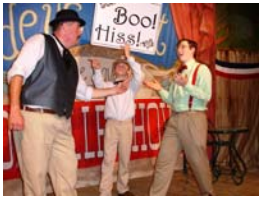
Will the Villain be successful in His dastardly plan??