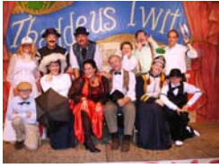
Celebrating community talent